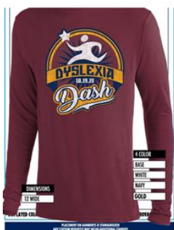
2019 Dyslexia Dash T-Shirt Design

Once you become a sponsor, we encourage you to form a team for your organization! We will send you all the information you need for you and your team members to register. Anyone registering under your team gets an automatic $5 discount. Some teams create their own t-shirts or other flair to wear on race day. This year, we will be adding a Team Spirit Award so encourage your team members to come out on race day wearing your teams' swag!