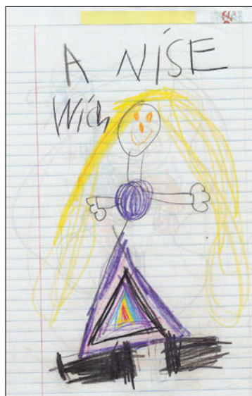
This child has selected s to represent the /s/ sound in nice .

Hard and soft sounds provide another opportunity to underscore that English orthography is more systematic than we may realize. It is not, in fact, random whether the c or g is pronounced with its hard or soft sound. Try pronouncing these two words: ceilent and gantin . These are made-up words, so you haven't seen or read them before. Yet most likely you pronounced the c as /s/ (soft) and the g as /g/ (hard). The reason is that c and g typically represent soft sounds when followed by e , i , or y , and hard sounds