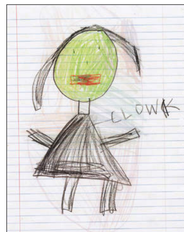
Here a child has used ow (as in slow ) to represent the /ō/ sound in cloak .

In some cases, we even have trigraphs in English—three letters representing a single sound. Examples of trigraphs